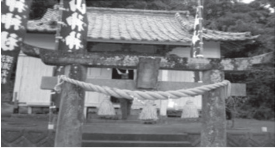
Figure 3. Yamanokami Shrine in Wakamatsu (Shin-Kamigotô) Photo by Sakai Yoshihiro (Fukaura Community), 23 September 2013.

There are other features of great interest. Typically, Kirishitan shrine festivals are characterized by the heterogeneity of their particular contents and contexts. This is unsurprising perhaps, as they are held annually by Kakure Kirishitan survivors in a very different political and cultural climate from that of their ancestors in faith.