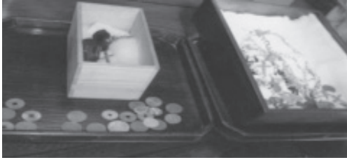
Figure 5.3 Camouflaged statue of Jesus, old medals, and rosaries (Fukaura community)