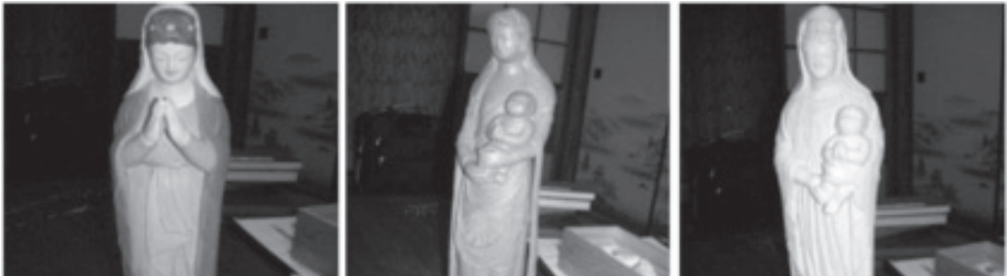
Figure 6 Wood carvings of the Virgin Mary painted blue, gray, and white (Murakami Community)