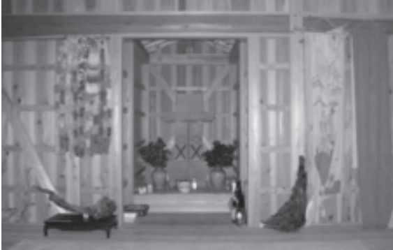
Figure 1.2 Interior view of Karematsu Shrine.