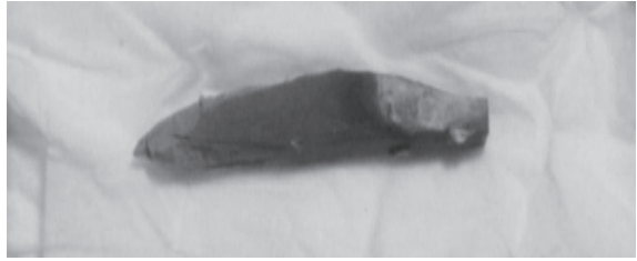
Figure 5.2 Sacred Wood of Bastian (Murakami Community) Photo by the Author, 19 July 2004. (For the whole story about this sacred item, see Munsu 2011: 169-170)