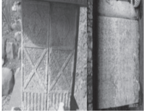
Figure 2-1. Front view of Kuwahime Shrine in Nagasaki City 2 March 2013

At Shimokurosaki and Wakamatsu we find two distinct and intriguing features of these festivals. Firstly, the basic structure of the festivals there displays the visibility of confessional affiliations. The Karematsu shrine festival (Nov. 3 rd ) in Shimokurosaki, for example, brings KakureKirishitan, Catholics, and Buddhists together— three religions, one festival —in ways not provided for by the established structure or the prevailing dogmas of officially established religions.