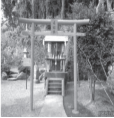
Figure 2-2. Tomb OtomoMaxência (Interior view of Kuwahime Shrine). Photo by the Author, 27 January 2008